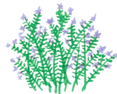
Aromatic Aster 1 plant