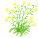
Lance Leaf Coreopsis 2 plants