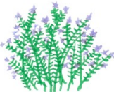
Aromatic Aster 1 plant