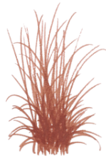
Little Bluestem 1 plant

Taller plants near middle or back of garden