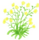
Lance Leaf Coreopsis 1 plant