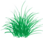
Prairie Dropseed 1 plant