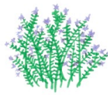
Aromatic Aster 1 plant